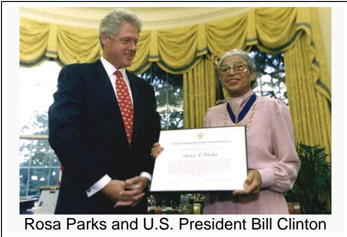
Rosa Parks and U.S. President Bill Clinton

This was called a boycott. They boycotted the buses.